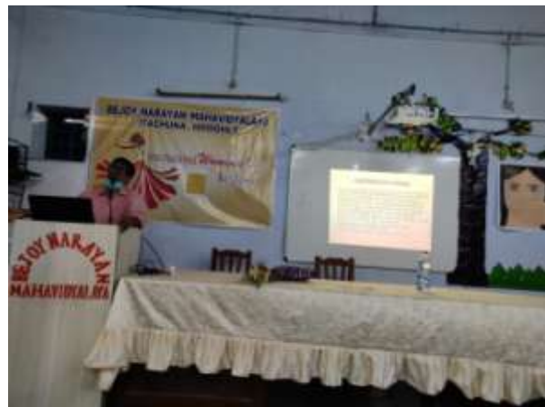
Some Glimpses of the program