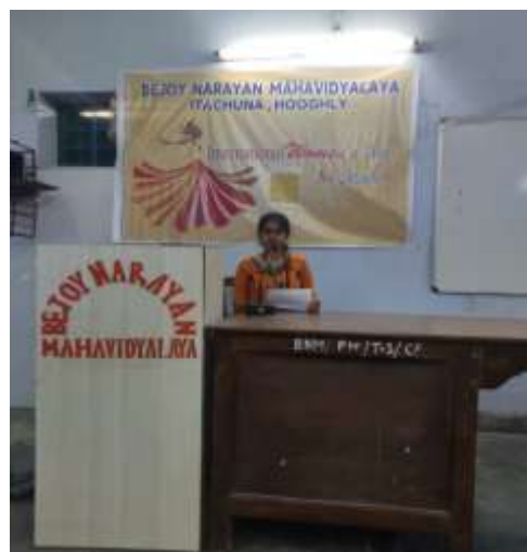
Students sharing their views